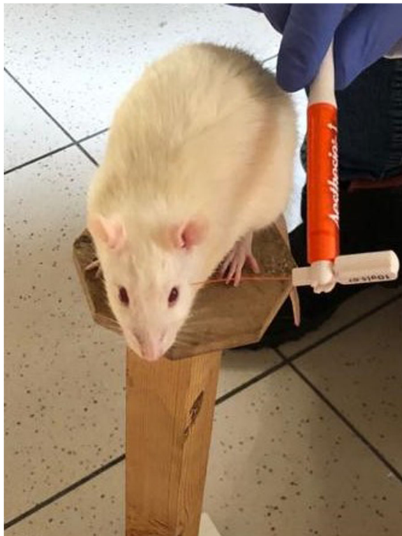
Fig. 3 Representative picture of mechanical allodynia assessment using von Frey filaments in a rat. Application of a filament to the periorbital area is demonstrated

thresholds [34]. Direct application of interleukin-6 (IL-6) produced dose-dependent facial and hindpaw allodynia in rats [36]. Interestingly, 72 h after the injection of IL-6, at a time when the animals had recovered from the allodynia symptoms, IL-6-treated rats became sensitive to usually innocuous triggers such as dural application of a pH 6.8 or pH 7.0 solution, or a systemic nitric oxide donor [37]. In the same study, an intracisternal administration of brain-derived neurotrophic factor produced allodynia and primed the rats to subsequent normally innocuous stimulations [37]. Other drugs could also induce allodynia when applied to the dura: TRPA1 agonists such as mustard oil and umbellulone [8], HIV glycoprotein gp120 [35], pH 5.0 synthetic-interstitial fluid [38], and meningeal TRPV4 activators such as a hypotonic solution and 4 \alpha -PDD [39].