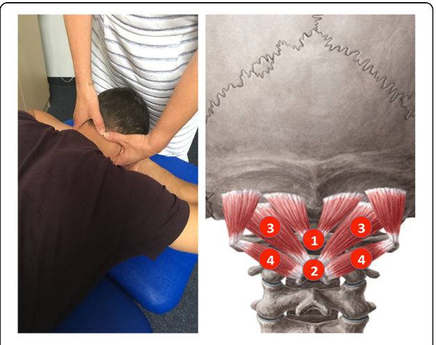
Fig. 1 Palpation of the upper cervical spine. 1 = midline C1; 2 = spinuous process C2; 3 = atlantoocipital joint; 4 = antlantoaxial joint

One hundred ninety-five of the 252 participants (descriptive data in Table 1) showed local tenderness on palpation of the upper cervical spine, 159 of these were migraine patients (Fig. 2). Ninety-three participants (82