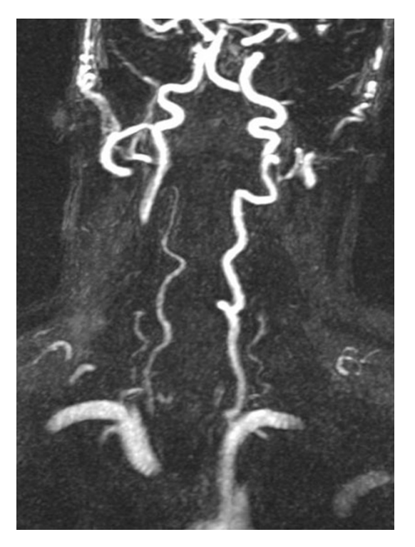
Fig. 2 Magnetic resonance angiography (MRA). Coronal maximum intensity projection from MRA reveals occlusion of the right vertebral artery, which is likely due to artery dissection

shock-like pains in the whole distribution of the first division (V1) of the right trigeminal nerve. Pain attacks fulfilled diagnostic criteria for symptomatic TN, according to the International Classification of Headache Disorders, 2nd edition (ICHD-II) [1]. They lasted for 3–5 s, occurred at least 10 times per hour, and were given a score of 8 out of 10 on a visual analogue pain intensity scale. No autonomic symptoms or trigger points were noticed. Between the painful paroxysms, the patient was free of pain. Treatment with gabapentin was initiated. While being on a