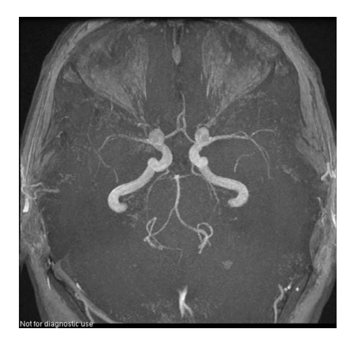
Fig. 2 An angiographic RM scan (using the time of flight technique, TOF, with digital three-dimensional reconstruction and planar projection on a T1-weighted sequence), which shows the stenosis of the basilar artery

On such basis a presumptive "cerebro-vascular" accident was diagnosed. Antiplatelet inhibitor and anti-hypertensive drug (ACE-inhibitor) were prescribed, and the patient was subsequently referred to an interventional center for trans-catheter PFO closure. A further diagnostic work-up with magnetic resonance angiography showed a marked hypoplasia of vertebro-basilar system, ruling out