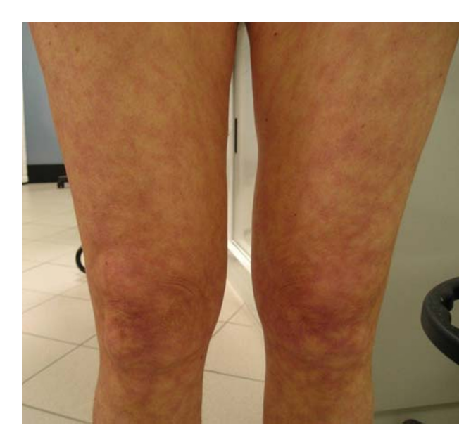
Fig. 1 Livedo reticularis in our patient

stiffness that progressively worsened in the previous years. The patient had a history of mild hypertension, well controlled by enalapril 10 mg, and a strong family history of headache. Her mother showed livedo reticularis and died when she was about 60 years old for cardiac valvulopathy and dementia. Two sisters showed mild livedo reticularis and myalgias. Physical examination revealed reduced skin elasticity with slight hypomimia, palmar erythema, malar rash, and widespread red dermographism. A pronounced livedo was present on arms, legs, trunk and neck, independently from patient position or room temperature. Neurologic examination revealed only slight lower left facial weakness and mild impairment of multiple cognitive domains (memory, attention, problem solving, and abstract reasoning). No other symptoms suggestive of particular forms of arteritis, or sleep disorders were referred. Cardiac and sovra-aortic vessels pathologies were excluded.