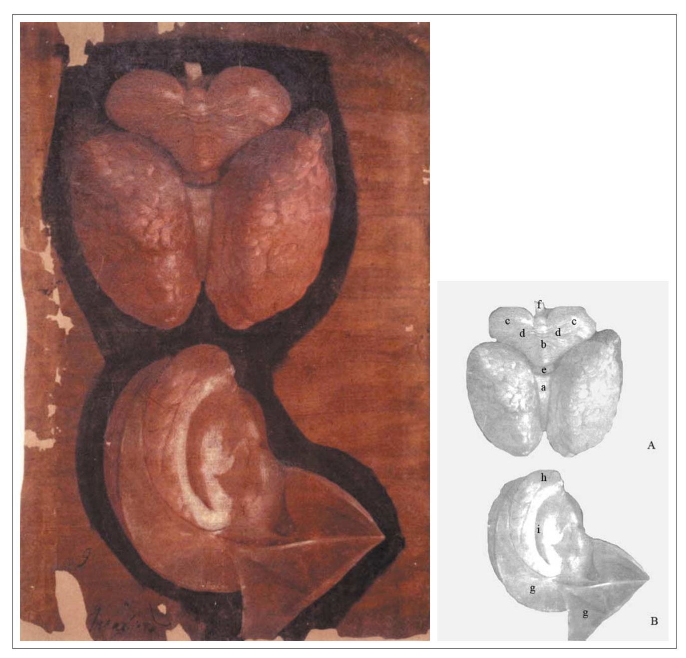
Fig. 1 A Dorsal view of the brain with mild opening of the longitudinal cerebral fissure and downward pulling of the cerebellum, in order to show the corpus callosum (a) and the superior surface of the cerebellum, with depiction of the cerebellar vermis (b) and emispheres (c). Cerebellar folia are clearly delineated. At the level of the superior surface of the cerebellum, a major transverse sulcus (d) seems visible, which could correspond to the fissura prima, separating the anterior and posterior lobes. The dorsal aspect of the rostral mesencephalon (e) and caudal medulla oblongata (f) are also recognizable. Notice that the original painting is faithfully reproduced with its upside-down position of the encephalon. B Right view of the brain, sampled together with the dura mater (g), which has been cut from the medial aspect of the frontal lobe (h) to the lateral aspect of the temporo-parietal region and pulled posteriorly. A right sagittal section of the brain has been performed in order to show the right lateral ventricle (i). [Marciana, Rari. Table 112.3. Size 480x286 mm.]

They are painted with oil and tempera, unfortunately on relatively fragile paperboard instead of canvas [9]. The realisation is clearly by different hands, as there are evident differences in style. Some artists have been proposed, among