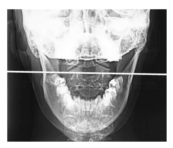
Fig. 2 Transoral X-radiogram

Our observation fulfils the IHS criteria of diagnosis for migraine without aura (1.1) and Cervicogenic Headache (11.2.1). It also fulfills the EHS Diagnostic Major Criteria for cervicogenic diagnosis.