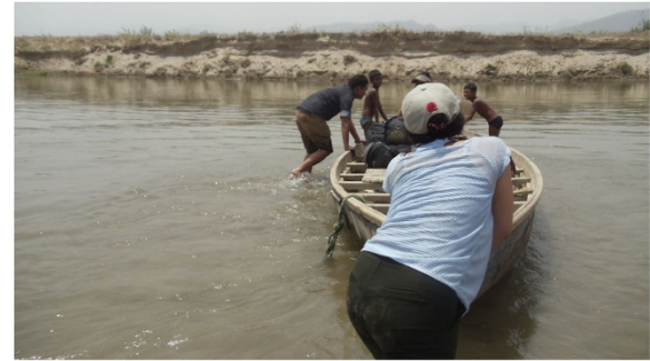
Figure 4 Access to a selected Terai district (Dang) in the Mid-Western development region is by boat.

the selected study sites. In a Mountain district in the Far-western development region, access to the selected village would necessitate crossing a river by manually-driven cable car, then travel via India.