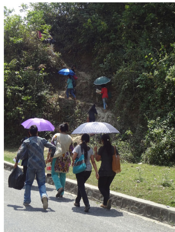
Figure 6 The journey to households in a selected Mountain district (Sindhupalchok) in the Central development region ends on foot and steeply uphill.

open their doors to an unknown and socioculturally different interviewer, and equally might not consent to be interviewed. This required recruiting interviewers with a fairly representative participation from all parts of the country, aiming to have at least one member in a team from the same district, or same physiographic division and development region, accustomed to the local culture.