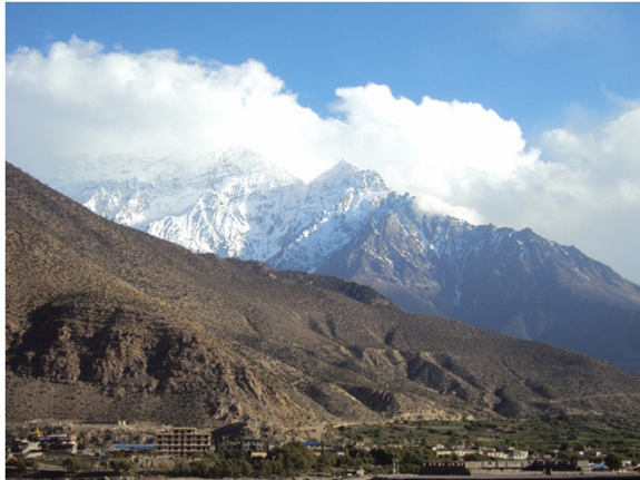
Figure 2 A selected Mountain district (Mustang) in the Western development region.

were necessary for rain-damaged roads, collapsed bridges (Figure 5) and (commonly) cancelled scheduled flights. The local member(s) of each team would guide the entire team (see sociocultural issues). The high likelihood of unforeseen complications meant a reserve team of interviewers should be kept available.