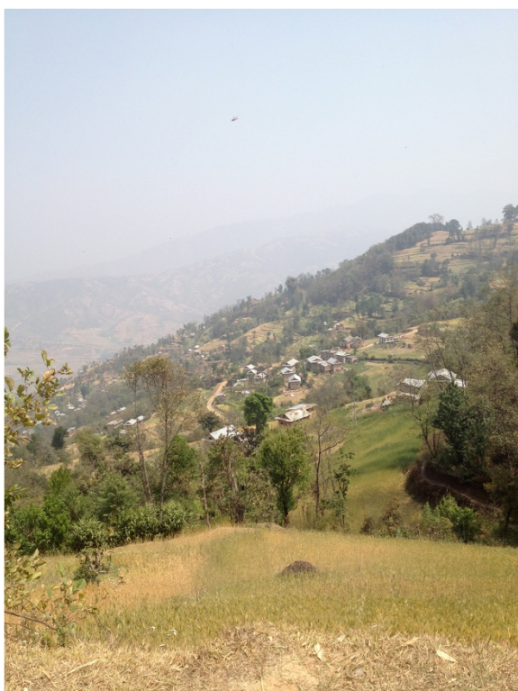
Figure 3 Households in a selected Hill district.

Three of the five Mountain districts were inaccessible by land. Even after flying to the nearest airports, two of these would require long uphill walks (Figure 6) to reach