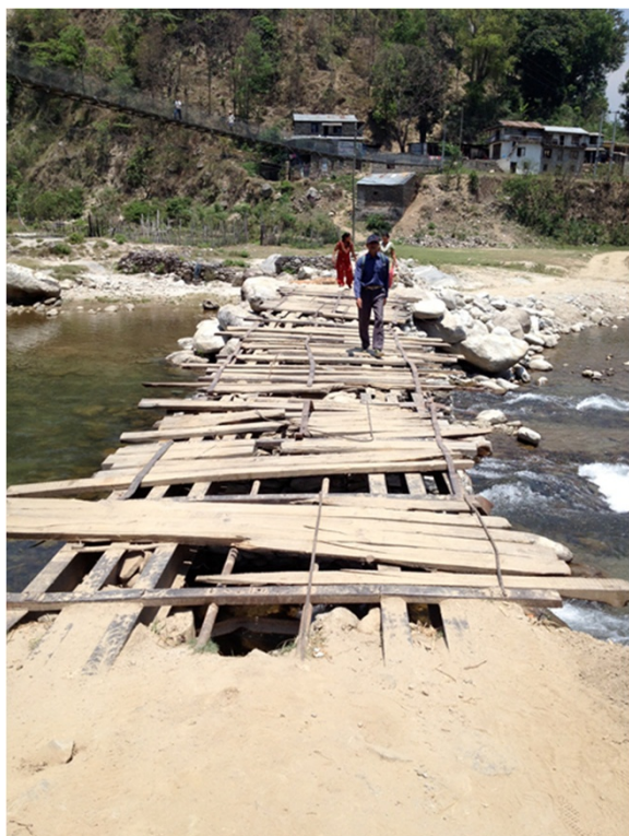
Figure 5 Access to a selected Mountain district (Sindhupalchok) in the Central development region is by bridge.